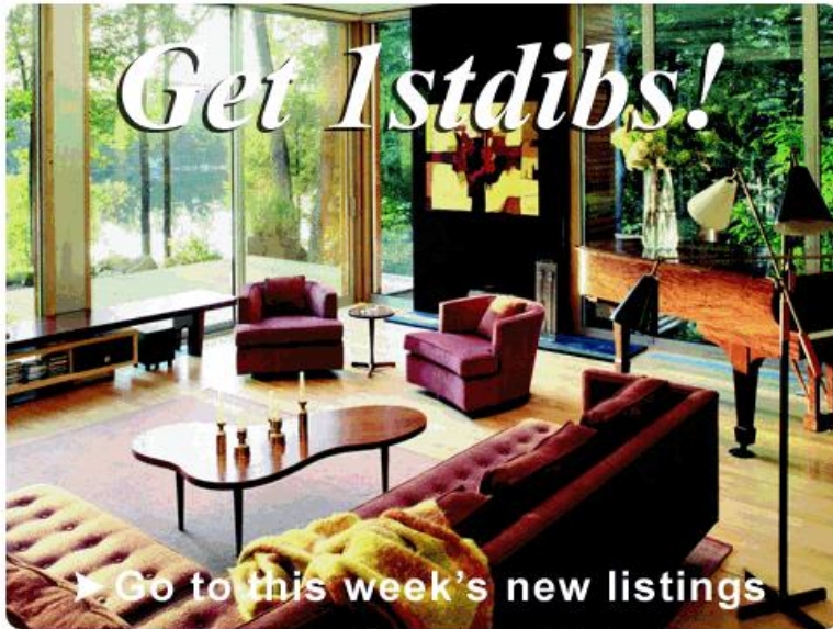
Design by Amy Lau .