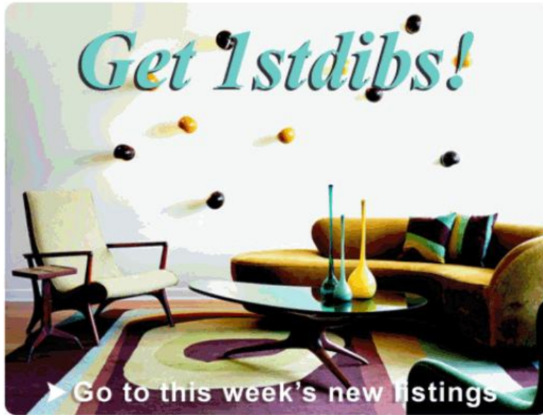
Design by Amy Lau .