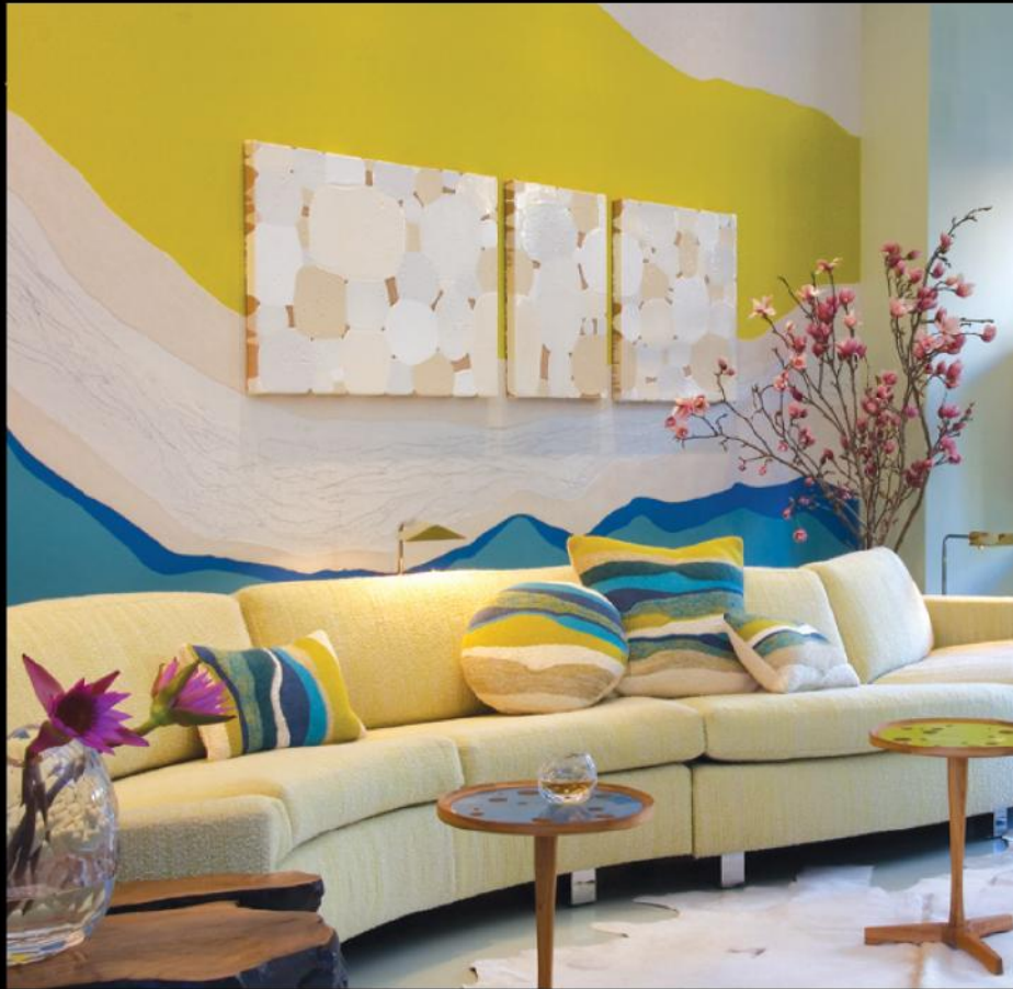
Design by Amy Lau. Kips Bay Decorator Show House.