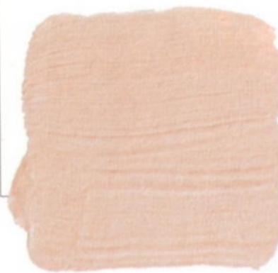
ANN DUPUY FARROW & BALL PINK GROUND 202

"It looks just like those dancing orange nasturtiums that climb and spill and ramble all over the garden. But I'd only use it in a low dose, as an accent color behind a bed or on a wall in a beach house, à la Barragán. Otherwise it would be overpowering."