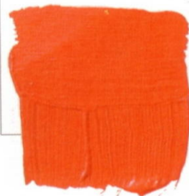
AMY LAU BENJAMIN MOORE RUMBA ORANGE 2014-20

"It looks just like those dancing orange nasturtiums that climb and spill and ramble all over the garden. But I'd only use it in a low dose, as an accent color behind a bed or on a wall in a beach house, à la Barragán. Otherwise it would be overpowering."